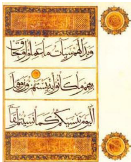
Image 2. pages from the Koran in order Rashid al-Fazl Allah, among the 33 line: Abdullah iben Abi - Qasim, 337 Tabriz, Tabriz school

Libraries, and it has been two-fold: writing and layout of the book consists of writing Art calligraphy (and Picture) painting (and other libraries and services that matter.( Azhand, 2004).