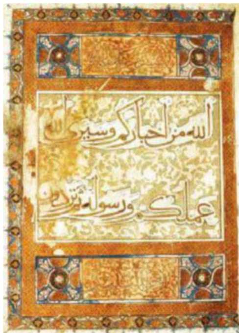
Image 3. pages from the qoran, in order Injo Abou izaq, part 33, line: Sufi Abdullah Yahya, Iran.

It can be less exclusive and eye Nvaztryn line art (Qur'an, epic, poetry, etc.) Shiraz school (eighth and ninth centuries AD), provided that both calligraphy and illumination, and both versions of great value. (Ghelichkhani, 2012).